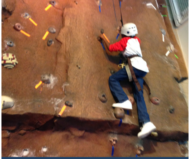
End of the Year Student Celebration