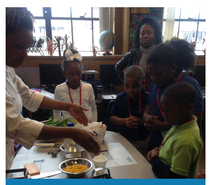
Cooking Matters Session