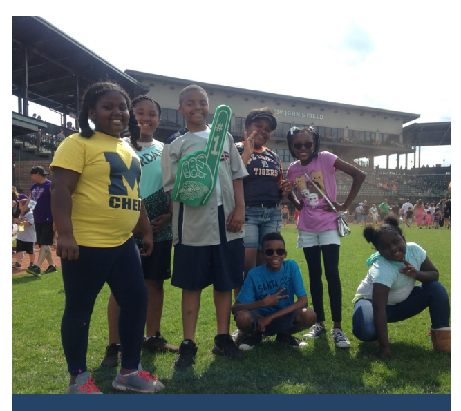
United Shore Professional Baseball League (USPBL) Game

Our collaboratively rich programs ignite a passion for education that inspires students to thrive academically. We provide safe spaces and intentional learning structures where students connect with dedicated mentors for guided, specified literacy interventions. We pave the way for community contribution towards children's lifelong love of learning through reading.